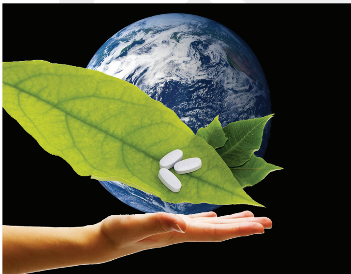
Photo: Illustration created by Milica Pešić using CC0 Creative Commons images (no attribution required).

Sound ethical oversight and responsible policy implementation needs to accompany exploration of medicinal species, whether bacteria, fungi, plants or