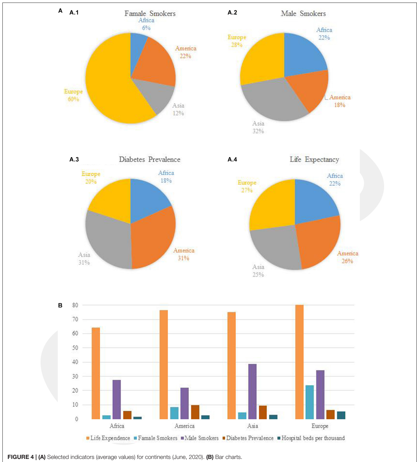
FIGURE 4 | (A) Selected indicators (average values) for continents (June, 2020). (B) Bar charts.

that (a) the increase in median age, age 65, and age 70 and older population will increase the COVID-19 cases during both April and June 2020; (b) the stringency policy is found significant to lower COVID-19 cases at the 25th, 50th, and 75th quantiles during April 2020; and (c) the stringency policy is important to diminish COVID-19 cases at the 75th quantile in June 2020.