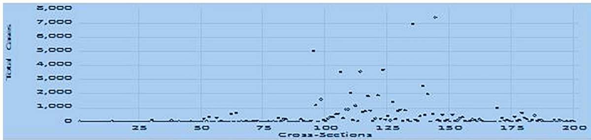
FIGURE 1 | Total COVID-19 cases per million (April 2, 2020).