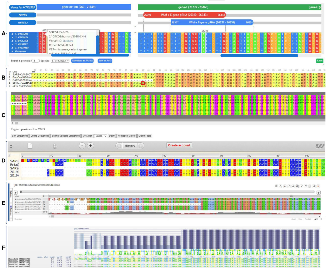
Fig. 2. Comparison of MSA visualizers. The MSA of different genomes of the severe acute respiratory syndrome coronavirus 2 isolates (SARS-CoV-2: MT123293, MT152824, MT252708, MN988713 and MT039888) was created, followed by visualization with separate MSA viewers. (A) Shown is the MSA visualization with MSABrowser, which enables the addition of annotations (e.g. domains and notes) on top of the MSA. MSABrowser allows users to incorporate variant-specific annotations (missense variation, disease associations, variant ID, allele frequency, etc.). A pop-up will show up when users click on the circled amino acid or nucleotide position to display the annotations. Shown is a missense variation (G6537T) in SARS-CoV, an example of a particular annotation of a nucleotide position, MSABrowser enables users to remove the desired sequence by clicking the X button which appears in the far left of each line. Users can look up positions, download the FASTA and save the MSA as PNG. (B) Shown is MSAViewer tool on the same alignment as in A. Users can scroll to the left and right to see the rest of MSA. When the user clicks on a position, the amino acid is highlighted with a red square as in the position 88. (C) Shown is JSV. It is possible to sort and delete sequences, add new sequences, change the colour schema and export FASTA with the buttons listed below the MSA. (D) Shown is Wasabi in which zoom in and zoom out options are enabled and scrolling is necessary to see the rest of the sequence. (E) Shows ProViz where users are able to search for a motif, switch to full screen, export the MSA and share it as a URL using the buttons located in the top right corner. (F) Shown is AlignmentViewer. For each sequence in the alignment, gaps ratio and identification ratio to the reference using the sequence is provided. Gaps and conservation per position are also shown above the MSA

PSAs and MSAs are the fundamental methods for the alignment of any sequences of DNA, RNA and protein (Chenna, 2003; Higgins and Sharp, 1988). The MSABrowser imports PSA and MSA data in FASTA format with a file, and variations and sequence annotation data in JavaScript Object Notation (JSON) (Pearson, 1999). After parsing the alignment data and creating the consensus sequence, it then creates two main components: the annotation part and the sequence alignment part. For performance purposes, instead of rendering all the alignment data at once, the MSABrowser renders as the user navigates through the sequence alignment. The positions