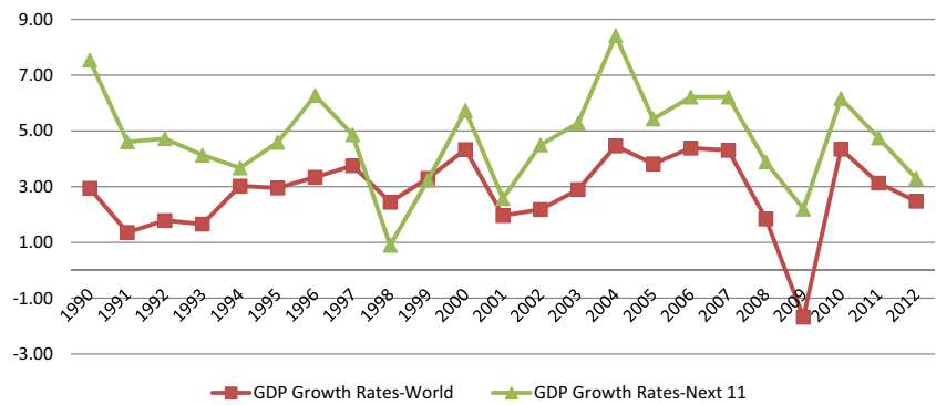
Fig. 2 Comparison of GDP growth rate between world and Next 11 economies

2018, as a part of their sixth development plan, and the investment in this sector is projected to be USD 10 billion by 2018 and USD 60 billion by 2025 (Wheeler and Desai 2016). This plan is aimed at enhancing the energy security of Iran.